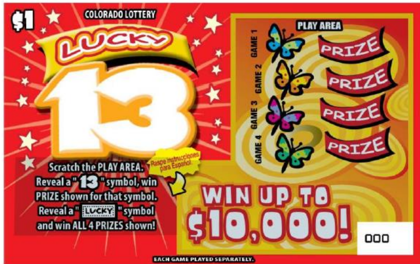
Exhibit A – Ticket Front Covered/Uncovered