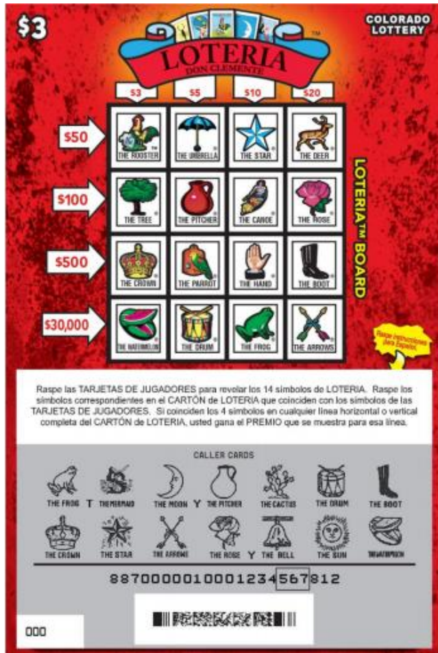
Scene 1 – Layout A