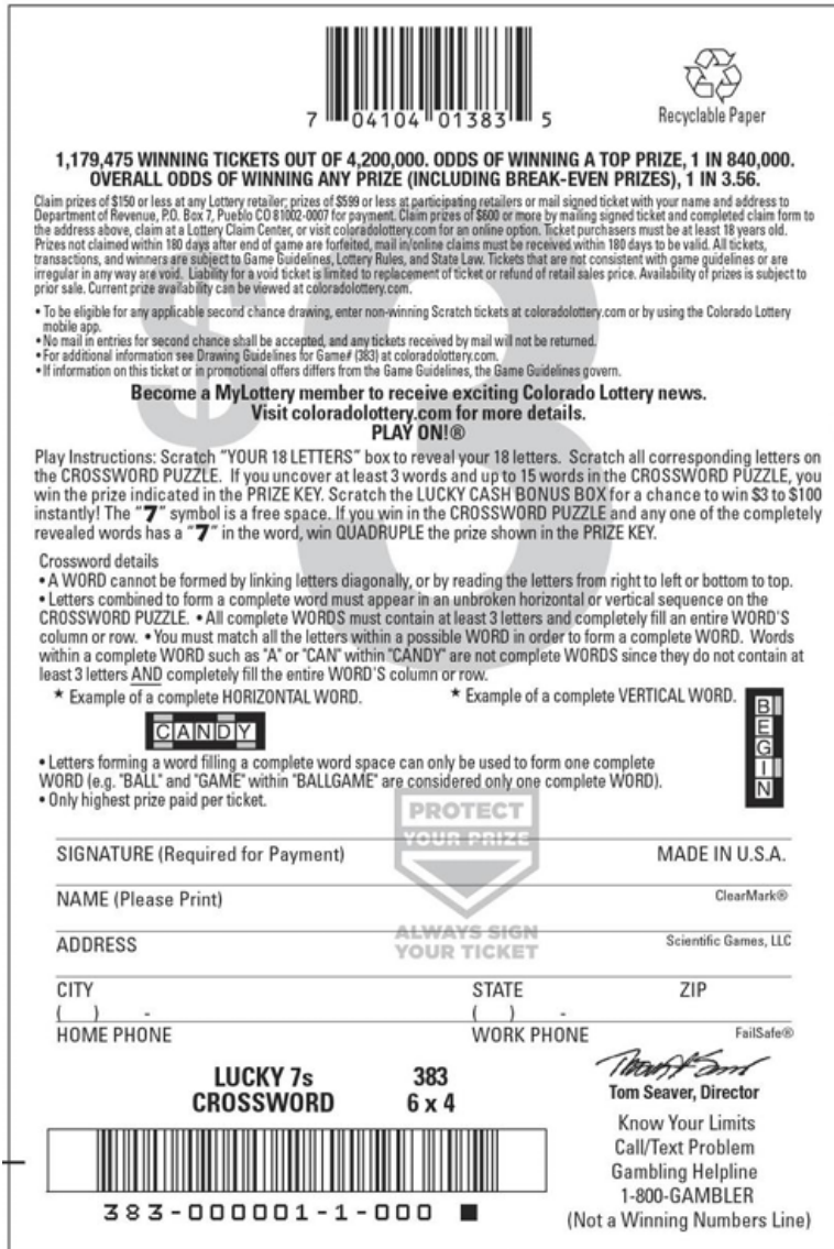
Exhibit A – Ticket Back