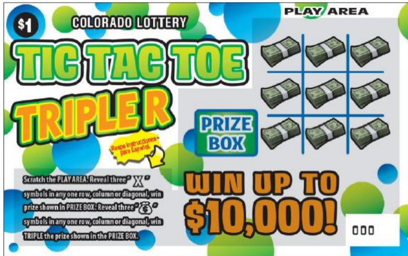
Exhibit A – Ticket Front Covered/Uncovered