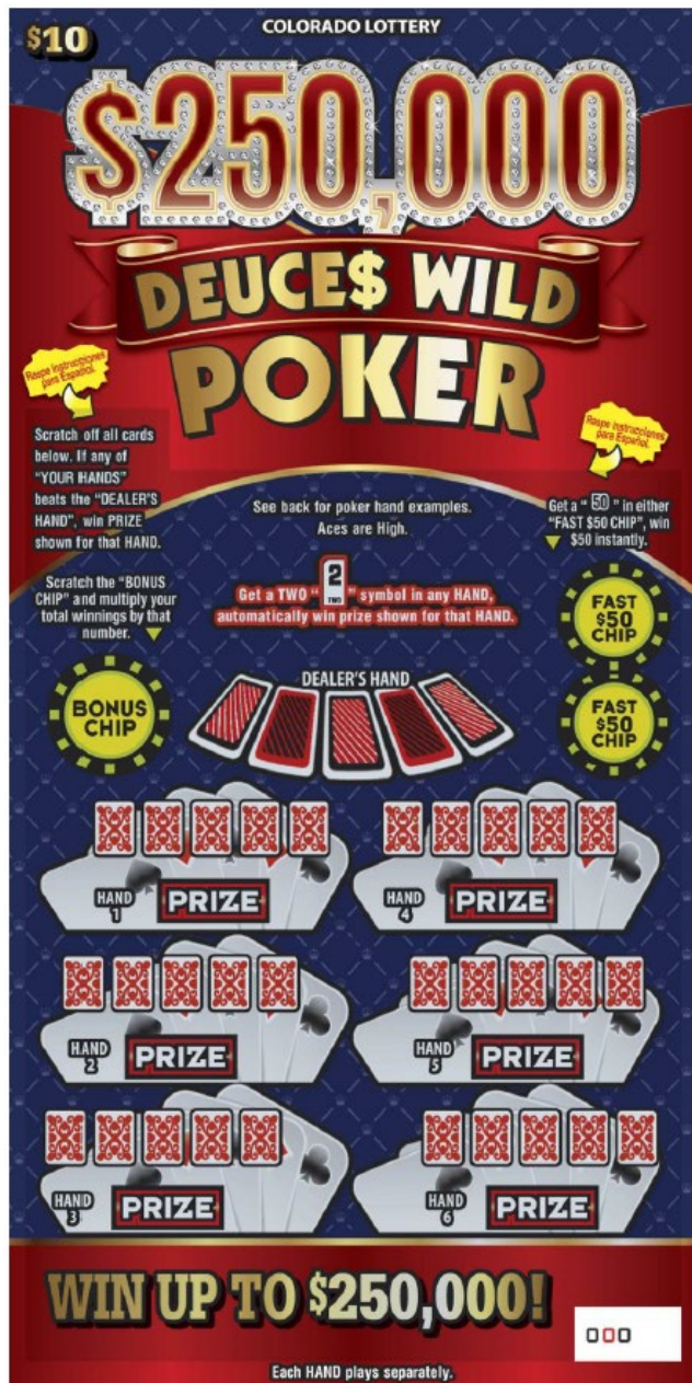
Exhibit A – Ticket Front Covered/Uncovered