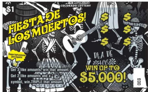
Covered – Scene 4