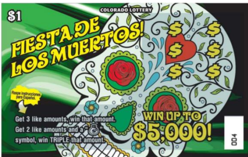
Covered – Scene 5