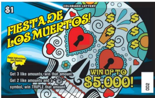
Covered – Scene 3