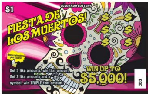
Covered – Scene 1