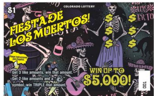
Covered – Scene 2