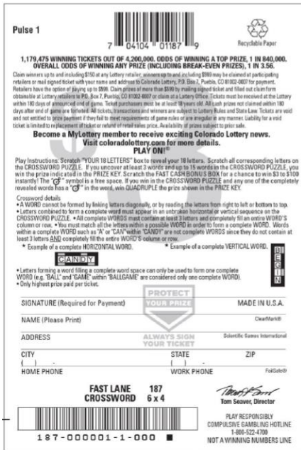
Exhibit A – Ticket Back