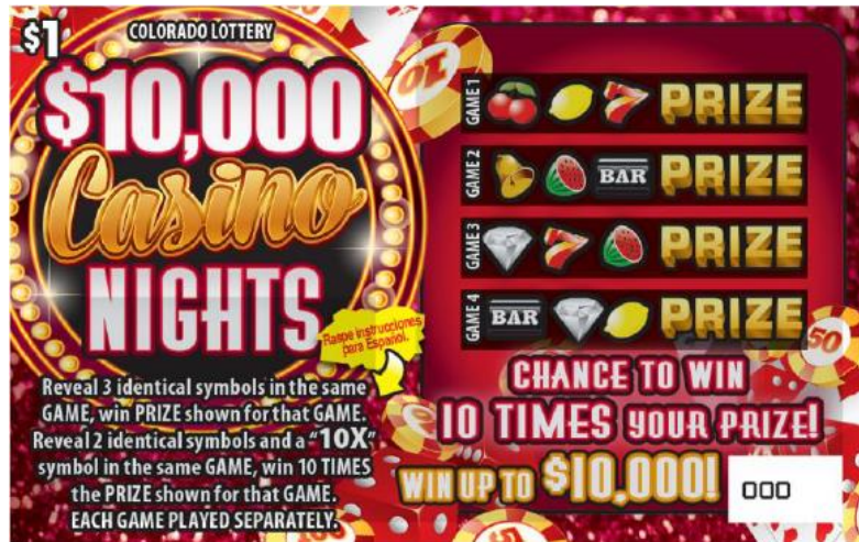
Exhibit A – Ticket Front Covered/Uncovered