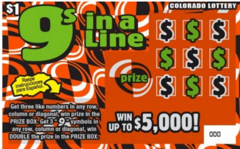
Exhibit A – Ticket Front Covered/Uncovered