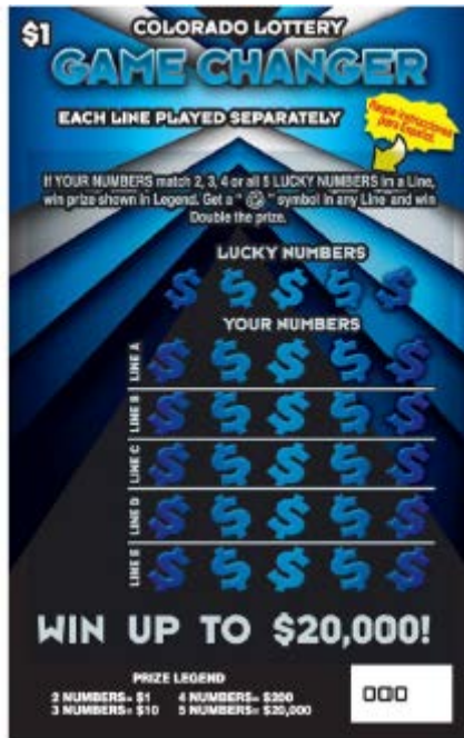
Exhibit A – Ticket Front Covered/Uncovered