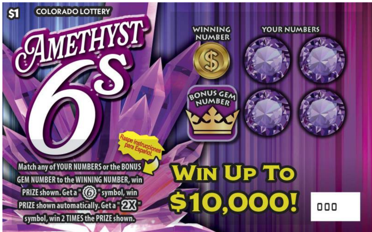
Exhibit A – Ticket Front Covered/Uncovered